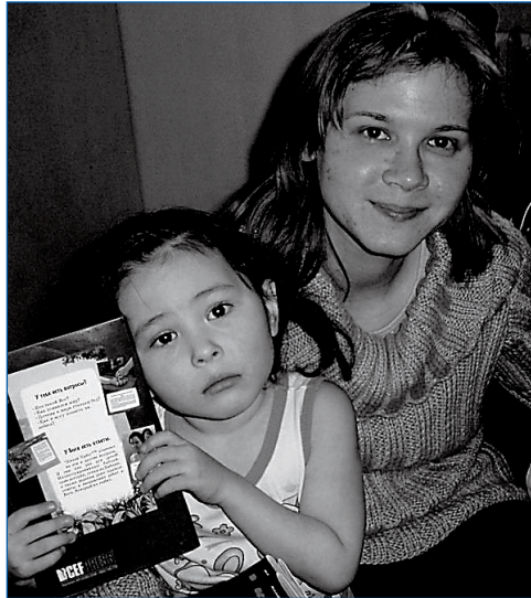
Children at the Khanty-Mansiysk mission events

"With our Father, there are many possibilities for help"